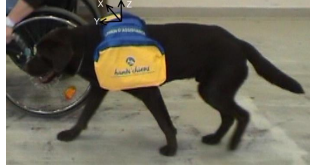
Figure 1 Dog with a smartphone on is back.

advantages: it is embed a small and powerful processor that already have many built-in devices, like GPS, camera, speaker, sensors, and communication capacities GSM, Bluetooth, Wi-Fi... So unlike Ribeiro et al. [6], which use two 1- axis accelerometer , we decided to take advantage of the sensor of the phone, in our case: <u>3-axis accelerometer</u>, 3-axis gyroscope, 3-axis magnetometer.